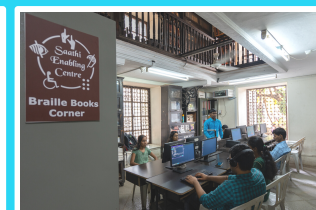
Saathi Enabling Centre and Braille Corner