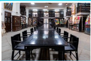
Reading Hall-Ground Floor