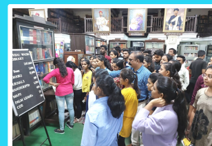
Library Orientation Programme