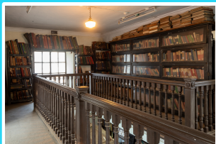
Bound Volumes Section