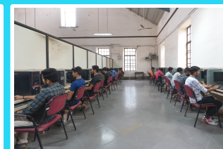
Computer Labs and Internet Facility