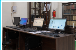
OPAC Search Section